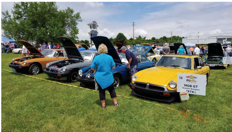
Rubber bumper MGB-GTs at MG 2018 (Look for complete coverage in the August Dipstick)