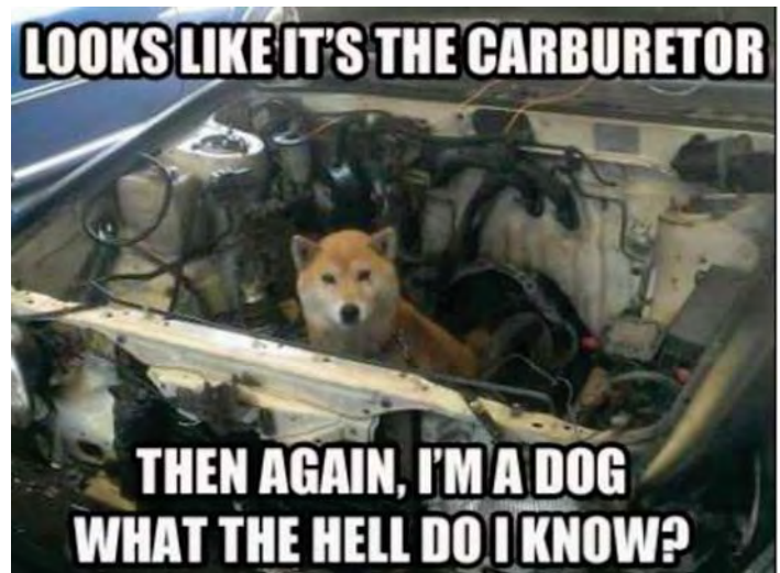
Tech Session mascot