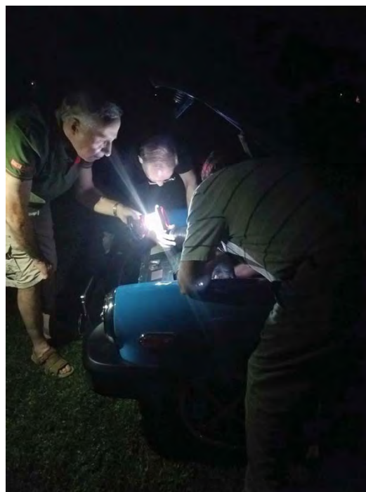
How many TMGC members does it take to get Rose's headlights to come on?