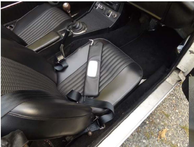
The unexpected ignition source

I am extremely lucky that I was not called away for even a few minutes from putting the top up. That would have been hard to explain to Hagerty!