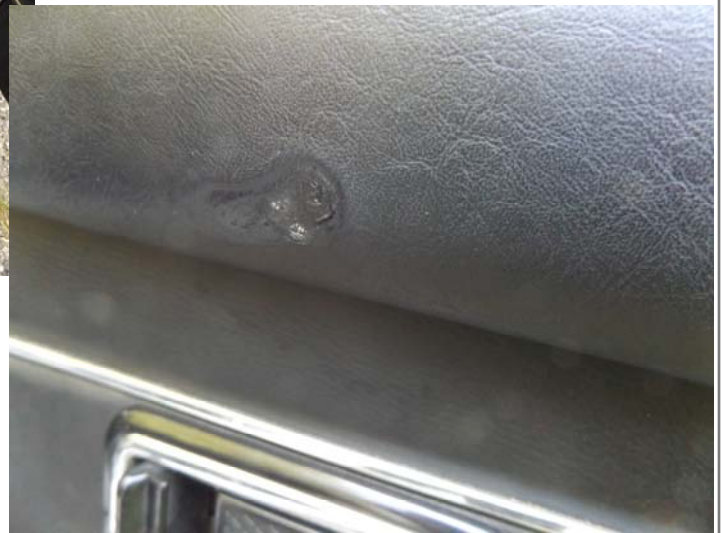
The mysterious hot spot