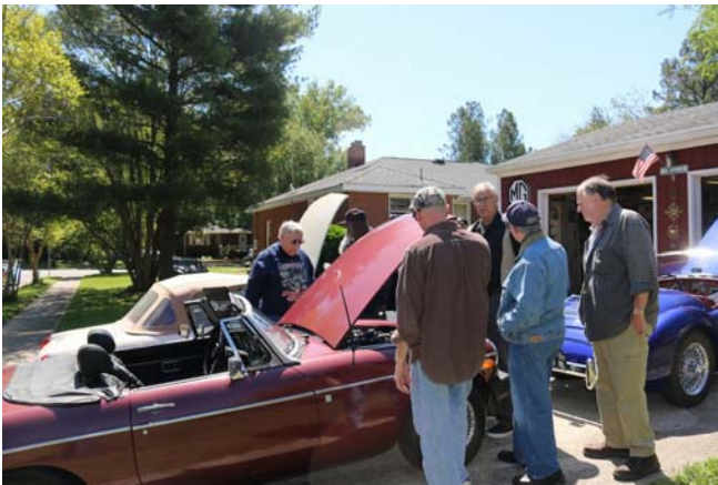
Yup, there’s definitely an engine in there!