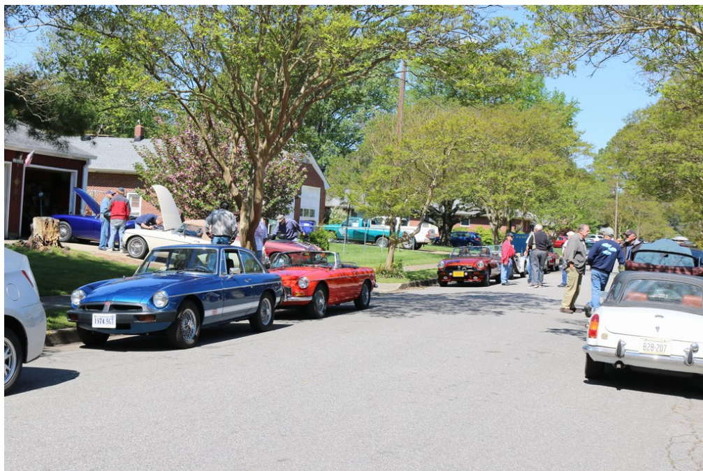
Spring Tech Session – open for business!