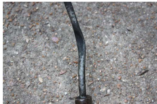
Typical crush-prone area is about 6 to 8 inches inboard of the backing plates

One last rear brake related job needed done before letting it go... For the last thirty years or so, regardless of what maintenance I might be performing, I've made a point to closely inspect both rear brake pipes, simply because I've found so many that have been crushed between the shock link and the differential tube or by roll back grappling hooks. . As an MGB ages, the springs flatten out, and the body sags, increasing the angle between the shock link and differential tube, while reducing the distance between the nearest points of contact – the brake pipe. The pipes are factory routed so as to intersect exactly between the shock link and the diff tube, resulting in a hammering effect on the brake pipe every time the rear suspension moves more than half travel. And this one was no different, plus a second crushed spot, inboard of the shock link on the left side, indicating that a roll-back operator had slipped a hook over the diff tube.