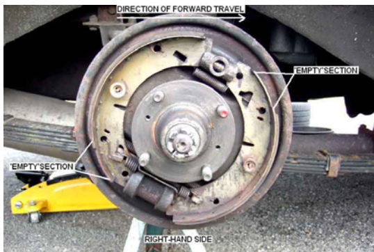
When properly installed, the "bell" shaped hole is located top and forward on left and right sides (this is the right side)