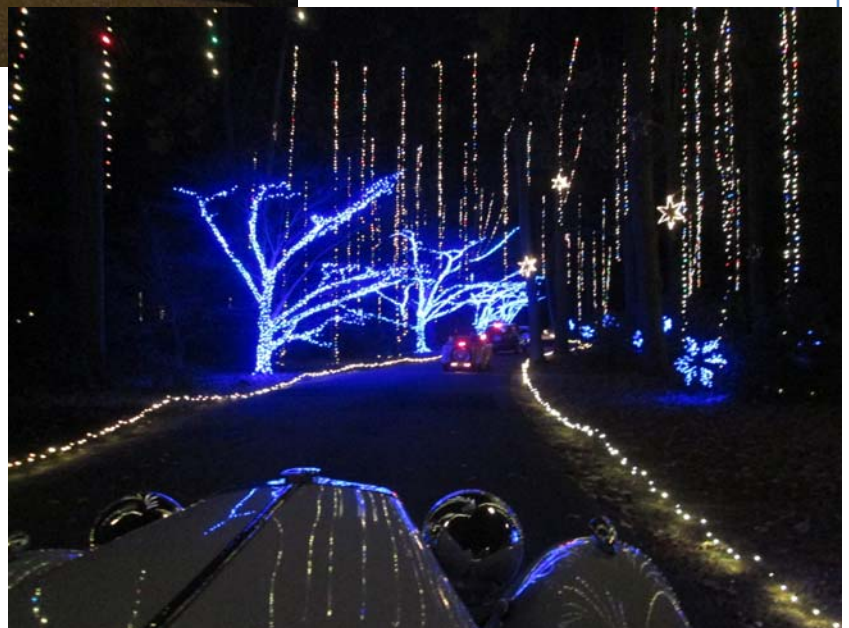
Along the Holiday Lights route