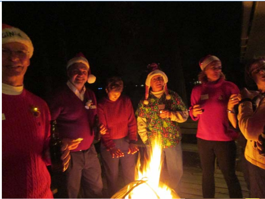
Cold beverages and a warm fire