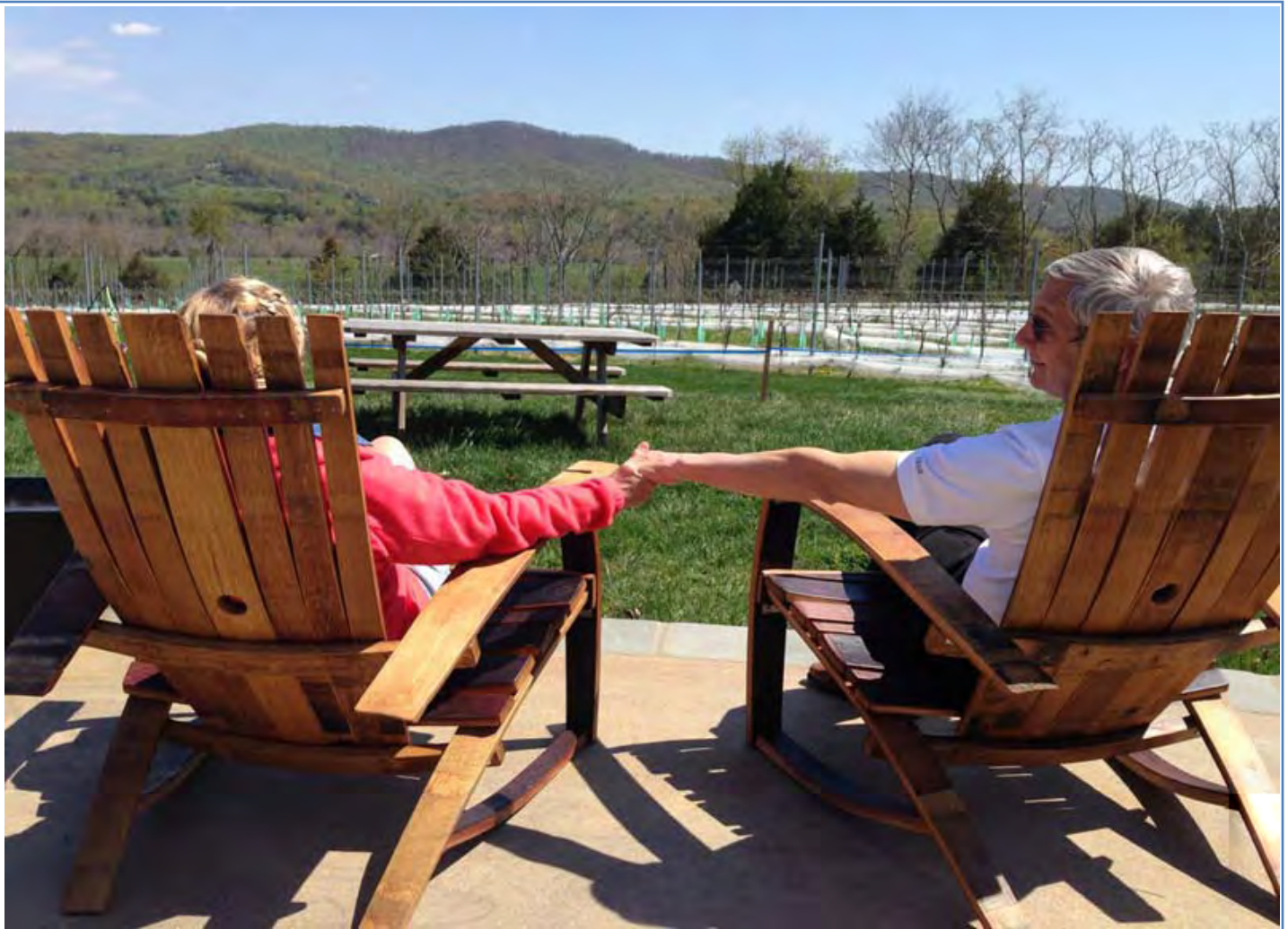
Wine Tour – Life’s Good!