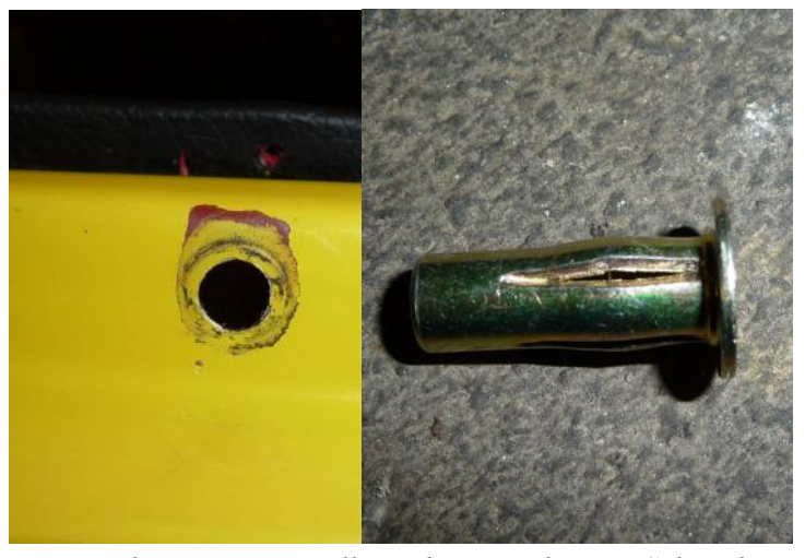
Here is the Process: Drill out the riveted snap. Select the rivet nut that fits the hole the tightest. Push the rivet nut into the hole and use the tool to draw the underside up to snug it in place. Remove the tool and thread in the Snap stud. All done, and easy to replace later.

The key to using these successfully is getting the correct rivet nut with respect to grip range. Every rivet nut has a stated grip range and if the metal you're inserting them into doesn't fall within that range, they won't hold.