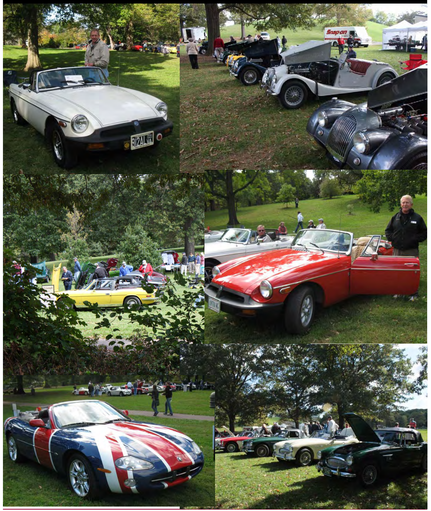
Volume XXIX, Issue 11 October 2011