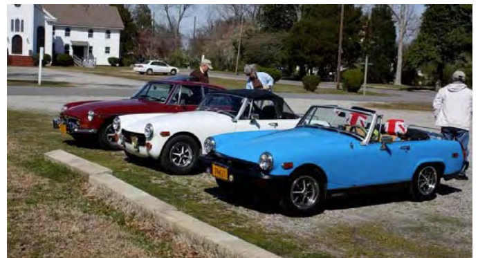
Red, White and Blue at Surry House

You can find more photos from the show on the web site. www.mg.org