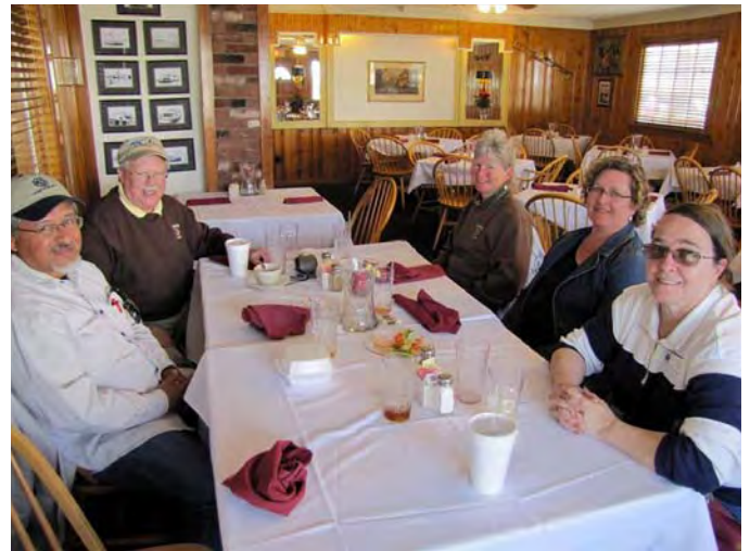
Dinner at Surry House