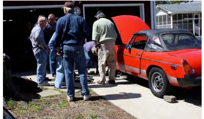
Supervising Pete's brake job