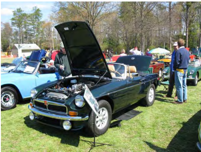
Frank Worrells' B

The field was a little crowded; it was the first time at that location but organizers promised more spreadout groupings next year. Here's a callout to TMGC members for an even greater turnout next year, possibly with a planned food stop after; you know we're always looking for another new good place to eat (or good old ones).